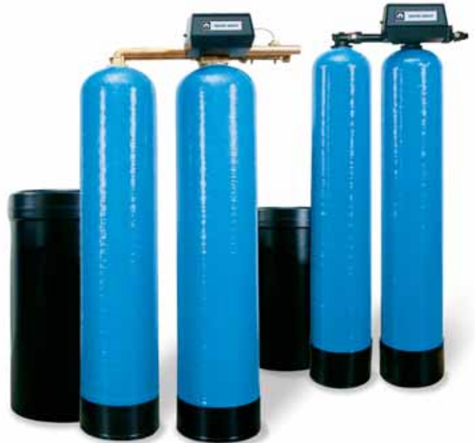
Above photo shows 1" and 1.5" ATW-Series Systems